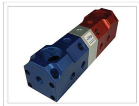
90° Port-to-Divide (PD)

Color: Red/Silver/Blue # of Inlets: One each end # of Outlets: (46) Max. # of Block: (11) Max.