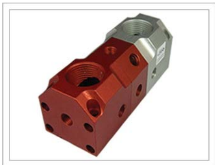
90° Port-to-Port (PP)

Color: Red/Silver or Blue/Silver # of Inlets: One each end # of Outlets: (21) Max. # of Block: (5) Max.