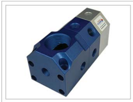
90° Port-to-Blank (PB)

Color: Red/Silver or Blue/Silver # of Inlets: One # of Outlets: (23) Max. # of Block: (6) Max.